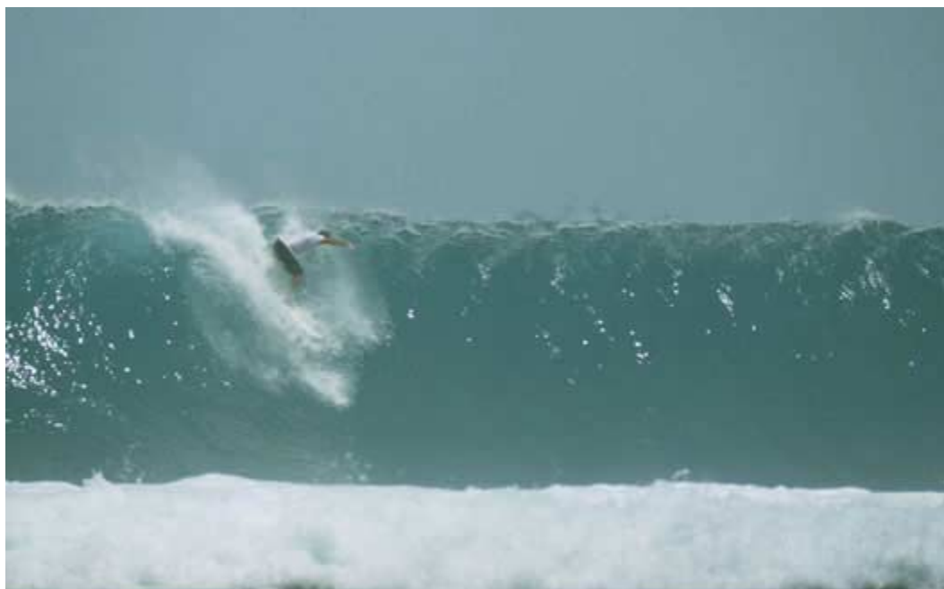
Robbie Nye and his speedline. Spring suit booty man in the tropics.

surf and travel all daylong! Finish the day with beer on upper deck and the local clove cigs! Then an awesome dinner. We moved back to anchorage for the night. Saw killer September sessions, which is unreal surf at various Mentawais, surf spots. Great music and surf. GT has unreal music selection. Good fun evening. Al and others play cards and yuck it up on the aft deck. My plan is to find and go for it on the next set of waves. Need to set the edge and go hard with my instinct and style. I know I can step up the surfing. But just need to get some good quality waves tomorrow.