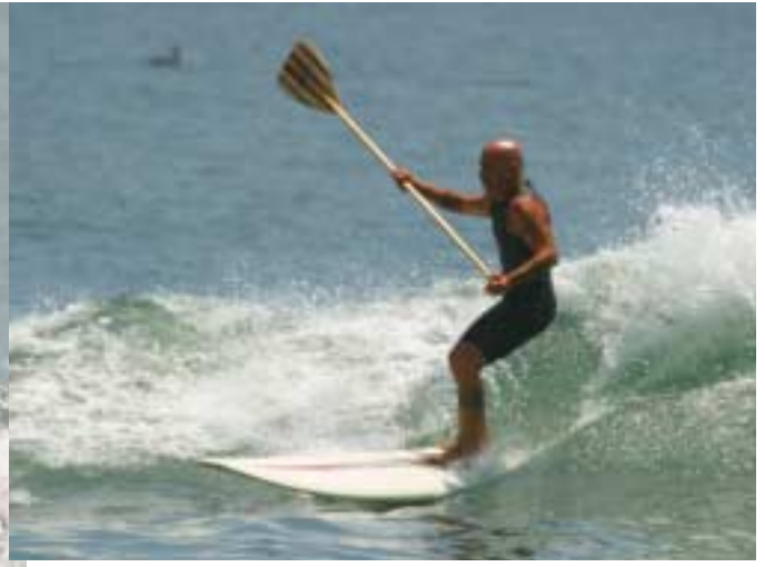
Malibu is a great spot for "Hoe Nalu"