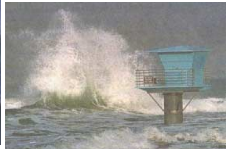
High Tide at Cardiff