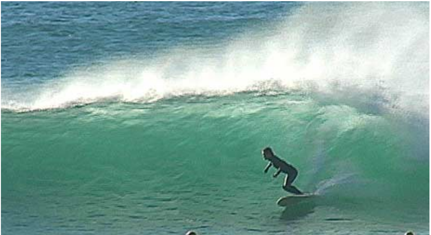
Calvin Tom knows where to sit to get the good ones.