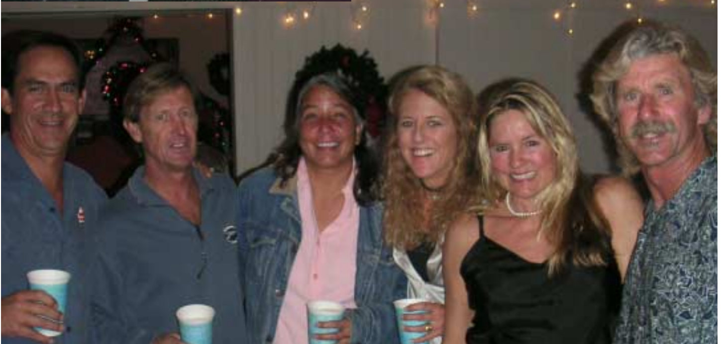
Swamis 2004 Holiday Party was a blast!