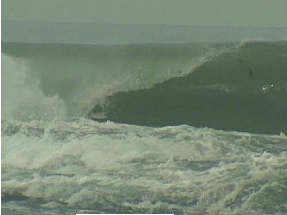
The Machine at Nias