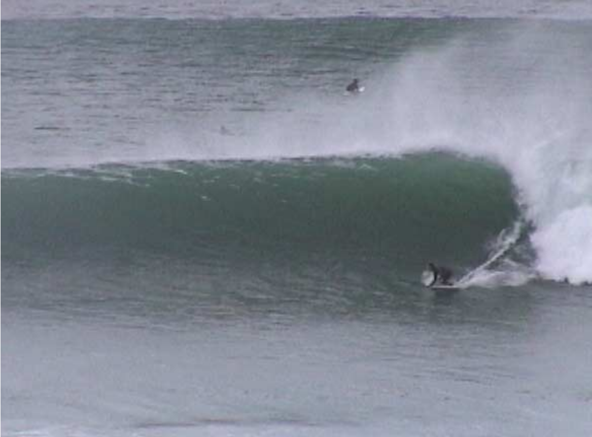
Gary? at ?